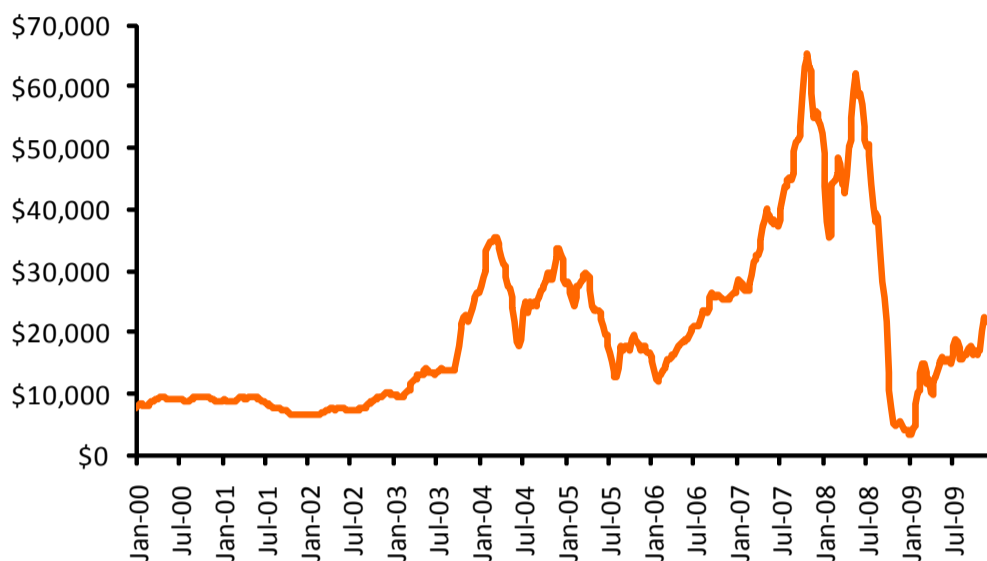
Bulker Markets: Handymax, 45,000 dwt, Average Trip Earnings